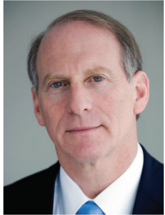
President Richard N. Haass

In response to the ever-shifting information landscape, we are incorporating cutting-edge strategies to produce and distribute content tailored for new constituencies. We are using infographics, chart books, and interactives to visually illustrate complex issues and major economic trends. CFR scholars connect with new and growing audiences on an array of social media platforms through their blogs , Twitter feeds ,