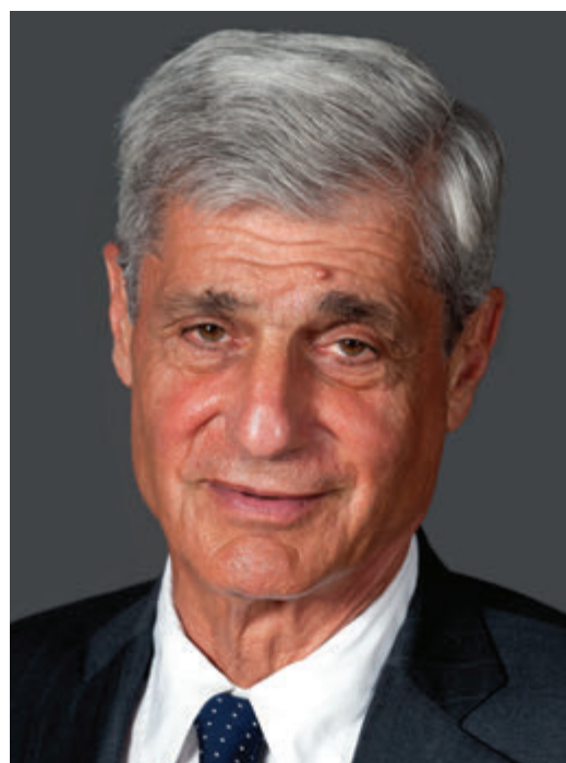
Co-Chairman Robert E. Rubin