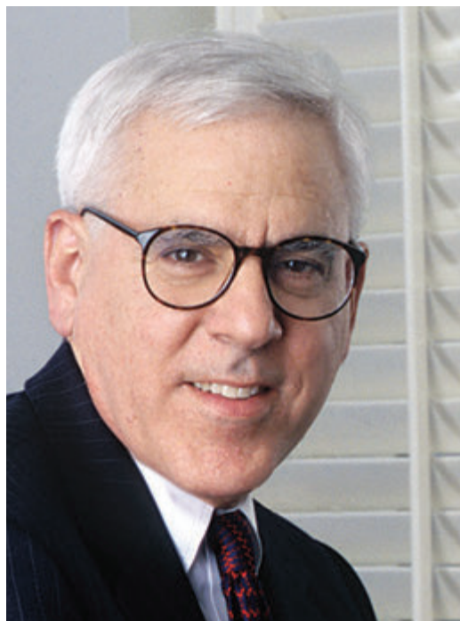
Vice Chairman David M. Rubenstein

Carla A. Hills Robert E. Rubin Co-Chairs of the Board