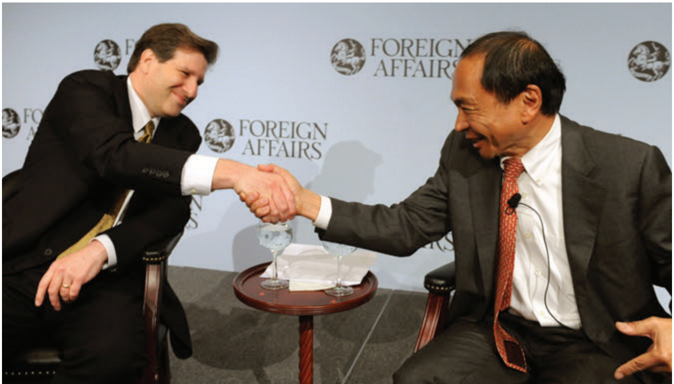
Foreign Affairs Editor Gideon Rose with renowned political scientist Francis Fukuyama at the Foreign Affairs LIVE event “The Future of History.”

3.2 million unique visitors and 11 million page views. More than 175,000 readers follow Foreign Affairs on social media (including Twitter and Facebook), more than 100,000 subscribe to our free weekly newsletter , and our Foreign Affairs videos on YouTube have been viewed more than 150,000 times. We will continue to embrace the digital revolution in the year to come and are currently developing an app for the iPad.