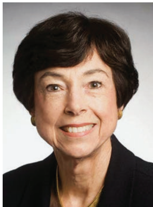
Co-Chairman Carla A. Hills